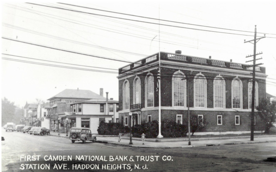
FIRST CAMDEN NATIONAL BANK & TRUST CO. STATION AVE. HADDON HEIGHTS, N. J.